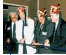
Feb. 3 1989 Research Grand Opening Celebration