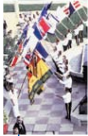
Oct. 5 1985 Hospital Dedication Ceremony