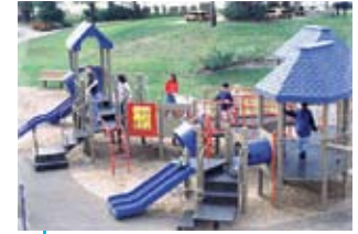
June 1995 Playground completed