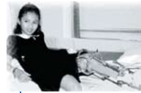
Oct. 28 1989 Seminar on new leg-lengthening system, the Ilizarov