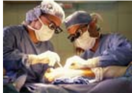
Nov. 15 1985 First surgery